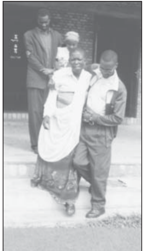
The Trust Walk

When I arrived in Rwanda in the summer of 2006, I was amazed by the normalcy of it all; the bustle of the marketplace, the constant flow of people on the roads, the ubiquitous sound of drums and singing that paced my steps. People seemed comfortable, even happy. Perhaps it was because Rwandans are so good at keeping up appearances or perhaps because it was just easier for me to believe, but I clung to this image. It was not until I attended my first Healing and Rebuilding Our Communities (HROC) workshop in September that I began to see the cracks in the walls. I met people at the workshop who hadn’t spoken to their next door neighbors in over a decade. There was one woman who was so traumatized that she rarely left her home; a released-prisoner who, until that day, had looked at all survivors as his enemy. I rapidly came to appreciate the immense distance that lies between peaceful coexistence and real reconciliation, between what I had seen on the surface and what lay just underneath. For many Rwandans, it is the difference between a life bound by compassion and humanity and a life overwhelmed by silence and fear.