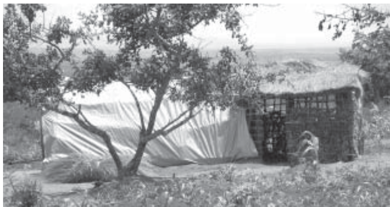
A house in Nemba